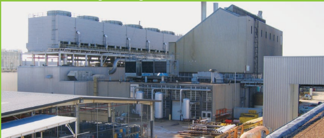
The powerhouse at Chrysler's St. Louis Assembly Complex provides steam, chilled water, and compressed air to both the north and south plants.