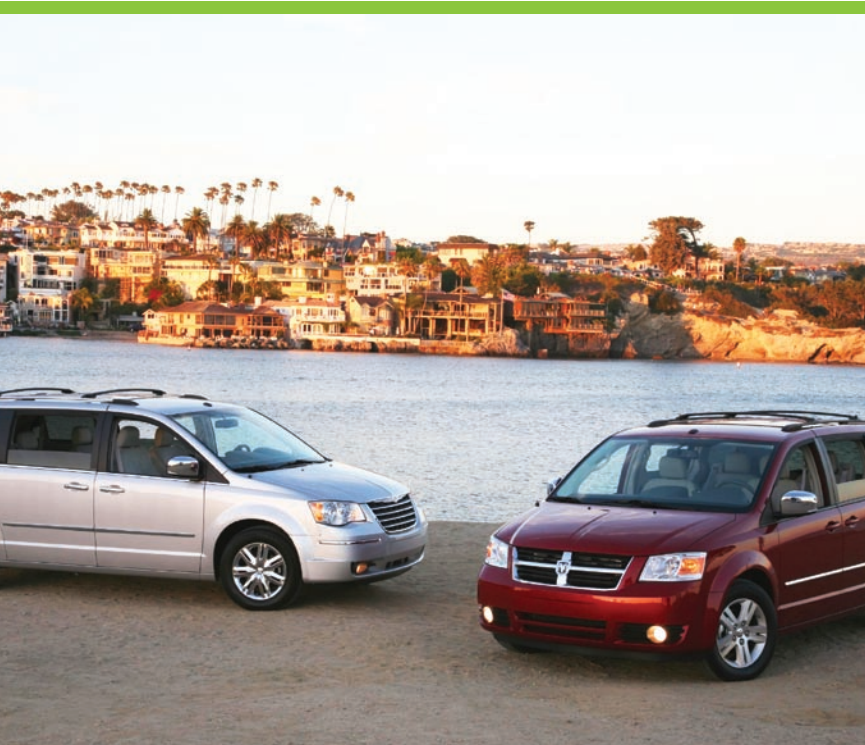
Minivans produced at Chrysler's St. Louis Assembly Complex south plant.

As part of Chrysler's energy management policy, independent evaluations are encouraged to provide fresh insights into potential energy efficiency opportunities. When a Save Energy Now analysis (based on the DOE Steam System Assessment Tool, or SSAT) uncovered innovative opportunities for energy efficiency in the steam system, the assessment team realized that these opportunities could enable them to meet corporate energy efficiency goals more quickly than they had anticipated. The company's Energy Champion worked closely with personnel in operations, maintenance, and its powerhouse to implement recommendations, and the complex's management provided full support to the Energy Champion to capture all economically justifiable opportunities.